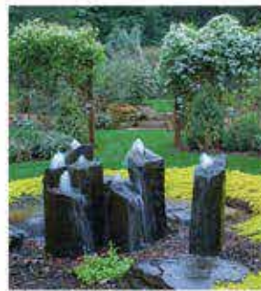
ARBOR SEATING AREA FOUNTAIN CONCEPT IMAGE