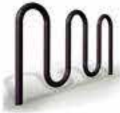
VICTOR STANLEY BRCS-105 BIKE RACK