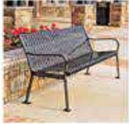
VICTOR STANLEY RB-28 6' BENCH