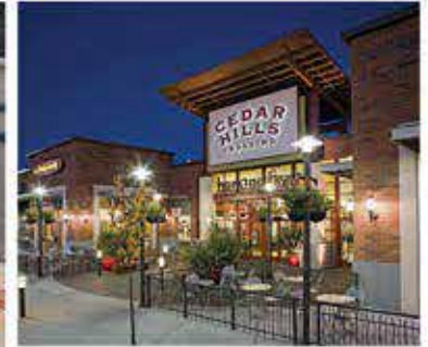
OUTDOOR DINING CONCEPT IMAGE