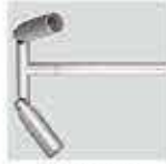
UPLIGHT AT CANOPY AREAS