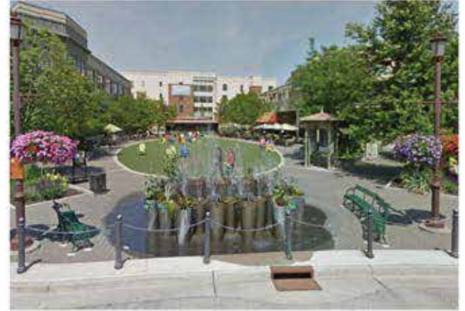
RESTAURANT PLAZA COURTYARD CONCEPT IMAGE