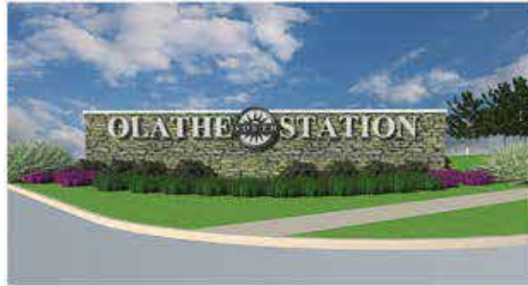
ENTRANCE SIGNAGE FEATURE