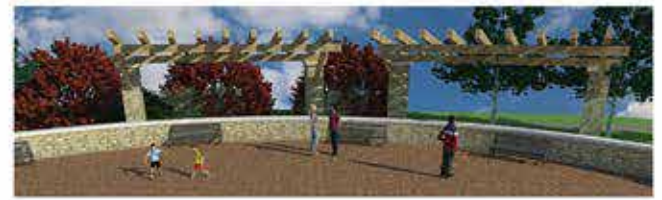
ARBOR SEATING AREA