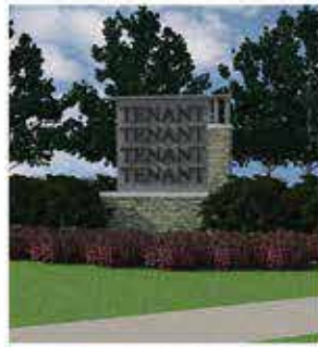
TENANT MONUMENT SIGNAGE