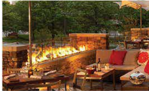
OUTDOOR DINING CONCEPT IMAGE