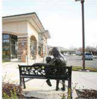
SEATING AREA SCULPTURAL IMAGE