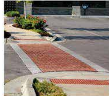
CROSSWALK CONCEPT IMAGE